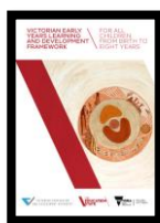
Victorian Early Years Learning and Development Framework

Approved learning framework: A document that outlines practices that educators and co-ordinators must use to support and promote children’s learning. The Early Years Learning Framework (Belonging, Being & Becoming) , the Victorian Early Years Learning and Development Framework and My Time, Our Place; Framework for School Age Care in Australia are approved learning frameworks for use in Victoria ( refer to Sources ).