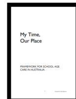
My Time, Our Place; Framework for School Age Care in Australia